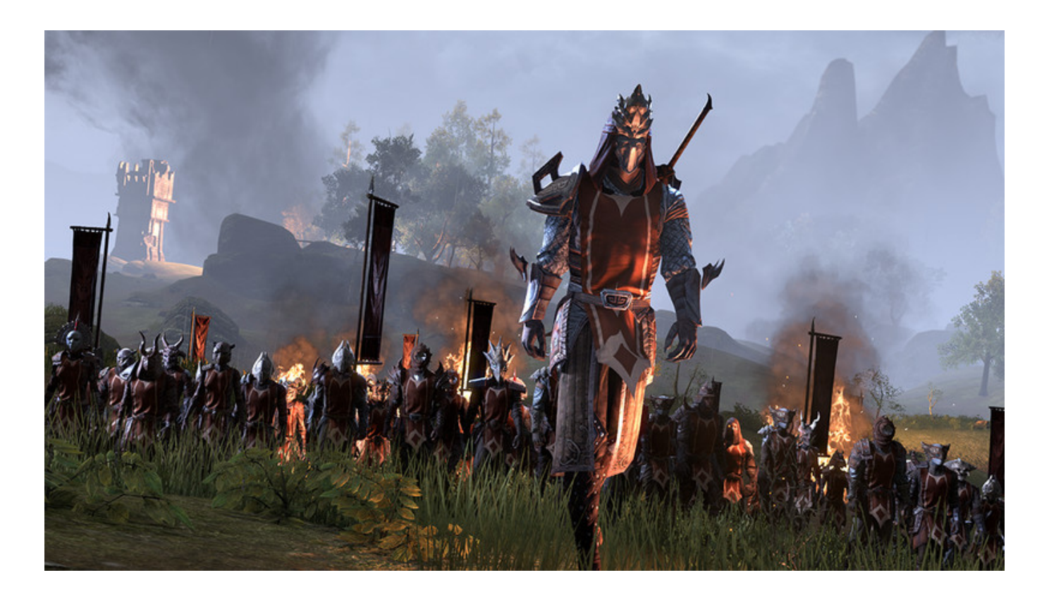
Download ->>> http://bit.ly/2SLoTiY

The Elder Scrolls Online: Plus Membership Keygen Download